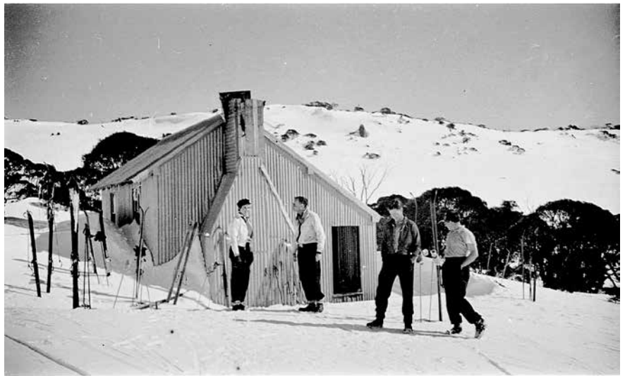
Mawson's Hut

"Ex Mawson's 7:30am. Crossed a ridge snout then down in the valley of the Valentine River; crossed it & skirted around 1 st ridge into a little valley, then climbed towards its head. Valley ran due NW to a saddle with big snow gums. From top can see a rolling sea of white ridges.