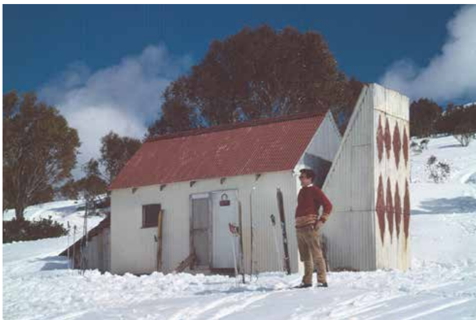
The Second Grey Mare Hut

By 1950 the original Grey Mare Hut was in such bad repair that the gold miners built a new hut a little closer to the Grey Mare gold mine tunnels.