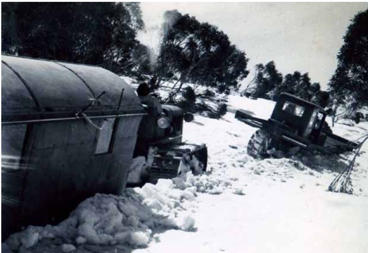
Motorised transport challenged by deep snow, October 1946 (Carl Walter Frankel Collection) (© Perisher Historical Society).