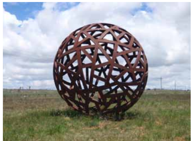
'Snowy River Sphere' by Richard Moffatt east of the Snowy Mountains Airport.

The artists were asked to consider the dramatic Snowy Mountains landscape, social history and aspects of economic development, and then create a large scale artwork that captured these elements. In assessing the artistic merit of the submissions, members of the shire's Public Art Advisory Panel also had to consider design, budget, excellence, relevance and maintenance. A number of locations were proposed by the shire's Public Art Advisory Panel, with final approval resting with the then RTA (now RMS).