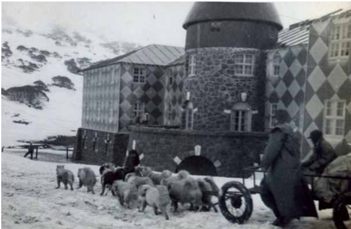
Canine transport at The Chalet, October 1945.